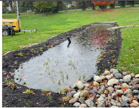
Holding water: 2"+ rain event 10/26/2021 – 5 hours after storm event ended