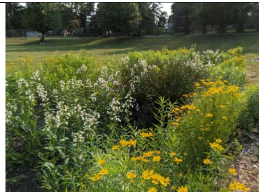
June 2023 (20 months post-planting)