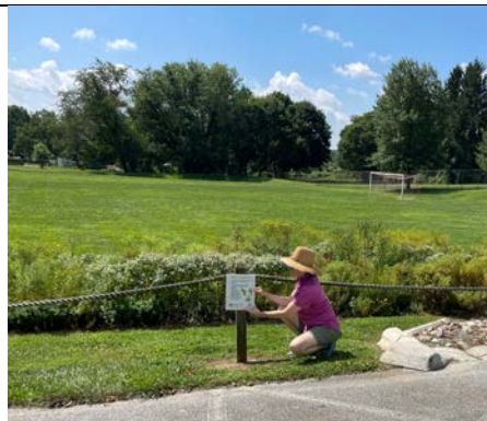
Adding Signage August 2023