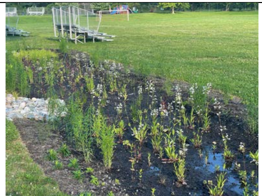
8 months post planting (June 2022)