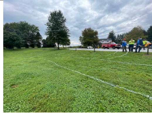
Before Construction (September 2021)