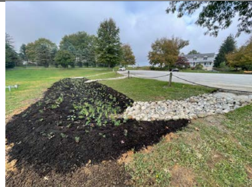
Planting Day, October 5, 2021