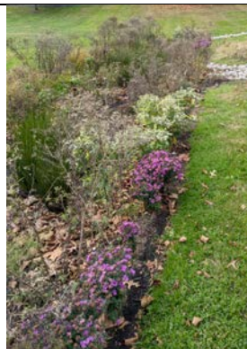
1 year post planting (October 2022)